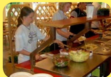
Good and nutritious food!