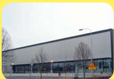
New gym with 36 tables in the same hall