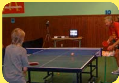
Your technique on DVD