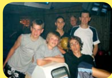
Activities every night (Bowling for example)