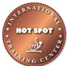
Table Tennis HOT SPOT: