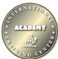
Table Tennis ACADEMY:

Based on the set selection criteria the Training Centers that gained membership in the Network are the following (listed by level and in alphabetical order):